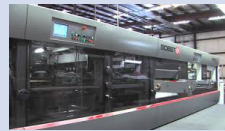
New generation Bobst