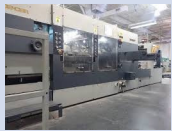
Older generation Bobst

Our range includes BOBST 102e, 102ce/cer, 142e/er, 142cer, all 106 formats.