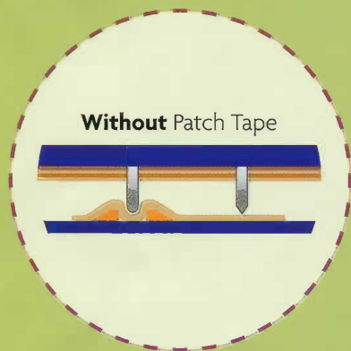
Without Patch Tape